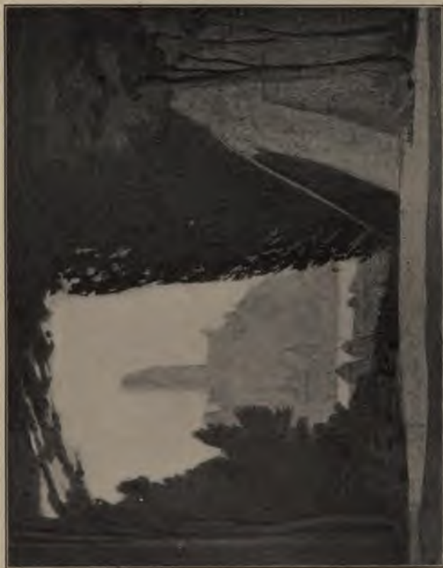
ACT FOURTH, SCENE I: JEANNE'S TENT NEAR TROYES; NIGHT